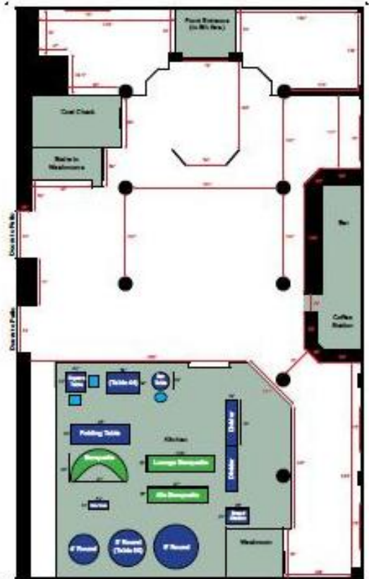
8 Avenue (Historic Stephen's Avenue) SE